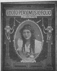
Photo-Play Music Folio

Arranged in Medium Grade. The characters of the Opera, together with a brief synopsis of the Libretto, date and place of first Perfor- mance, Birth, and Death Year of Composer and other important items are also in- cluded in these volumes. CONTENTS Vol. I. Selections From "Carmen" by Bizet "Faust" by Gounod "Aida" by Verdi "Bohemian Girl" by Balfe Volumes 1, 2 and 3 new read-