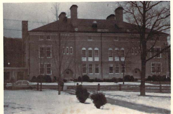
THE GILBERT SCHOOL