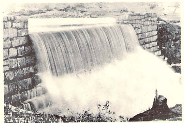
RUGG BROOK OR WINSTED RESERVOIR DAM